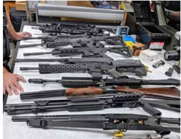
Guns Confiscated in Sunnyvale