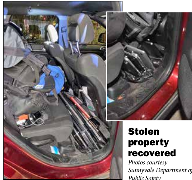
Stolen property recovered

affected residents and DPS were able to work together so officers could bring the suspects to justice and get back stolen property. It’s this sense of community and working together that keeps Sunnyvale one of the safest cities in America.”