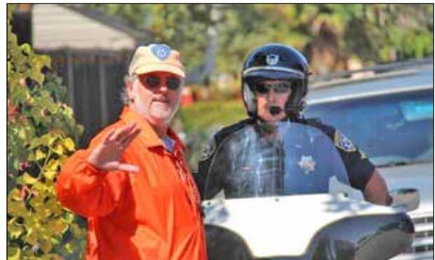
Sunnyvale crossing guard and Public Safety Officer, 2013.