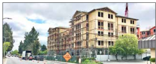
The St. Anton residential development project at 1108 E. El Camino Real