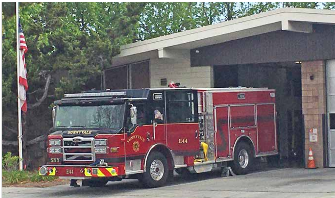
New fire apparatus placed into service at Sunnyvale Fire Station 4

engines are nearing completion of the manufacturing process and are expected to be placed into service at Sunnyvale Fire Stations 1 and 6. Station 1 is located at the corner of N. Mathilda Avenue and W. California Avenue; Station 6 is located at 1282 Lawrence Station Road. The four engines cost $2.6 million, paid for by the Sunnyvale General Fund, and were built by Pierce Manufacturing of Appleton, Wisconsin.