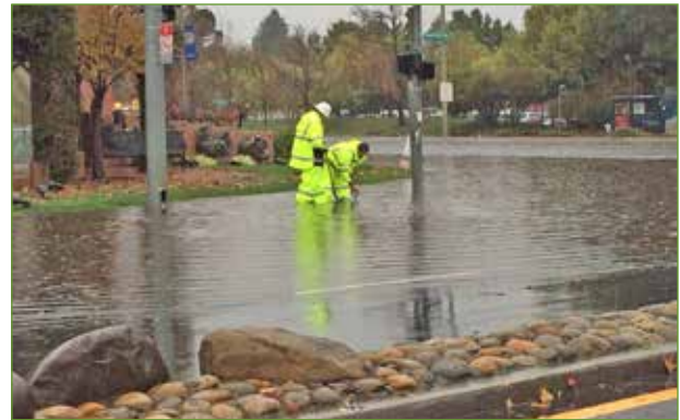
Sunnyvale's field crews are ready to get to work on storm related issues, including blocked storm drains. This photo is from the morning of December 11, 2014.

to 4 p.m. call 408-730-7506. After 4 p.m. call 408-730-7180.