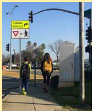
(L) Sunnyvale middle school students approach the southeast corner of El Camino Real and Poplar Avenue. (R) A Sunnyvale pedestrian makes use of the HAWK Beacon at El Camino Real and Helen Avenue.