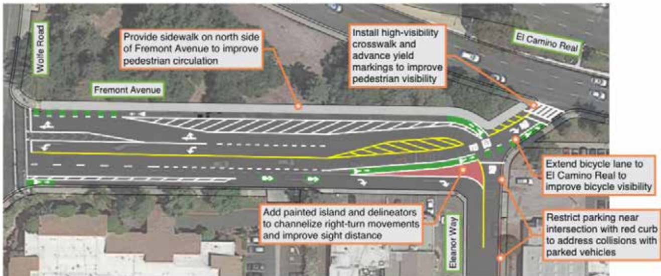
Preliminary Concept Improvement Layouts - Detailed Engineering Design and Analysis Required.